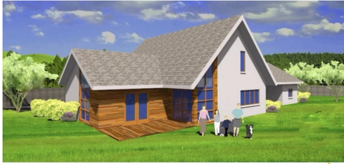
House type D , plots 2 & 3